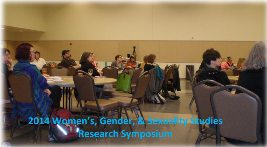
2014 Women's, Gender, & Sexuality Studies Research Symposium