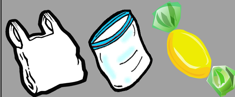
Plastic Bags & Wrappers