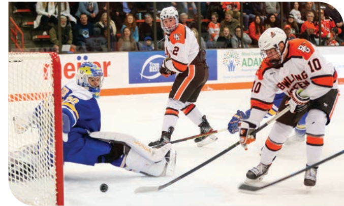
Top 20 collegiate hockey programs of all time

Through our programs in the arts and Division I Athletics, BGSU is a major contributor to the social and cultural vitality of northwest Ohio and beyond. With one of the broadest offerings of arts programs in the state of Ohio, the University hosts more than 440 arts and cultural events per year, and our 18 athletic teams compete at the highest level of intercollegiate athletics. We are members of the Mid-American Conference and the Central Collegiate Hockey Association.