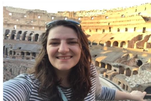
A view from the Colosseum