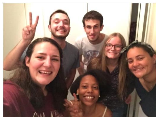
International Dinner Party with Fellow International Students