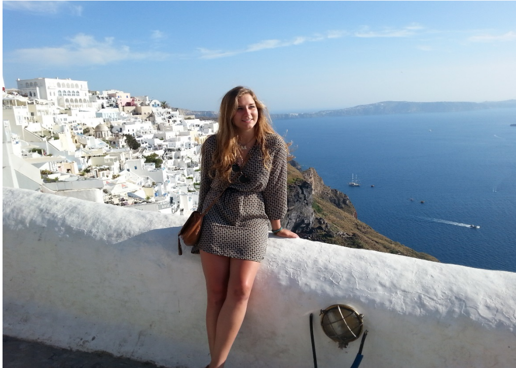
INTERNATIONAL PROGRAMS AND PARTNERSHIPS, EDUCATION ABROAD