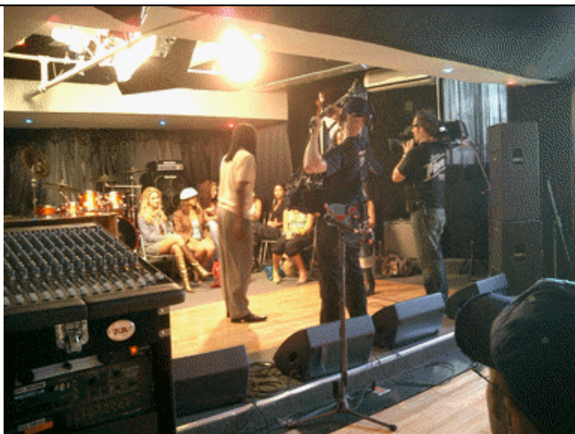
Smash Studios, New York City

Some of my clients include Marky Ramone from The Ramones, MGMT, Lou Reed, Patti Labelle and the Labelle's, Busta Rhymes, MTV, and more. I do enjoy what I get to do with my job, for example tonight I'll be helping with some stage production and engineering for Billy Gibbons from ZZ top, and Warren Haynes (from the Allman Brothers Band and Gov. Mule) and Derek Trucks might stop in for the set. It's exciting getting to work with people who I grew up listening too.