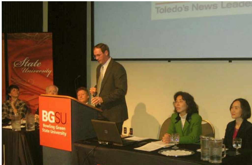
“Digital Television Transition in Ohio” Panel at BGSU February 4, 2009

The event was broadcast live on WBGU-TV and repeated several times on different digital channels of WBGU-TV.