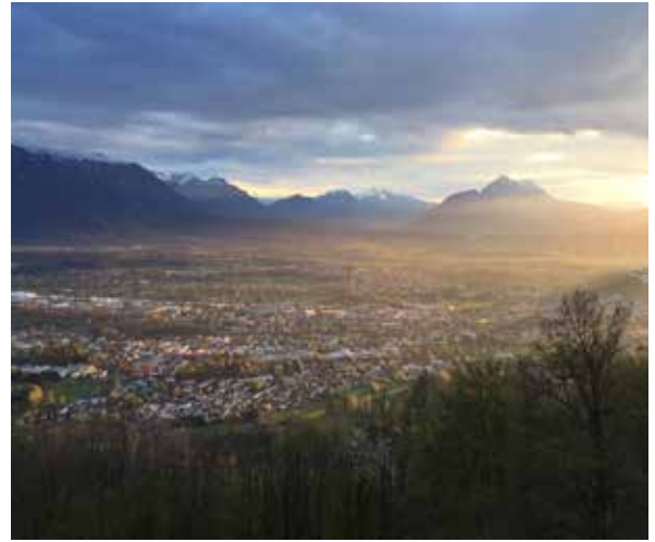
View from the mountain farm

I worked at the International Office at the University of Salzburg, and doing so was a great opportunity to work on my German language skills by speaking with my co-workers. I also truly value the translation experience I got when helping translate portions of the International Office webpage into English. I had never really thought about the possibility of working as a translator, and although I cannot envision doing that full time, I could certainly imagine doing occasional freelance translation work. I expected to get some experience with general office work and maybe to improve my interpersonal communication skills, but this experience gave me far more than just that. It is amazing how much you can learn in 30 hours.