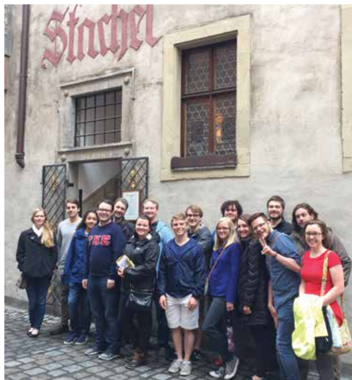
Outside the Stachel in Würzburg

While students surely enjoy our annual Berlin trip as a time away from the classroom, I was struck again by how much this is also a learning experience and a form of learning that cannot be replicated in the classroom. How different it is to stand at remnants of the Wall, cross over the two rows of cobble stones that remind us where the Wall used to divide Berlin, look at the graffiti Russian soldiers left in 1945 on the interior walls of the Reichstag, or stand on the parking lot where Hitler's bunker was and be able to point to the spot where he committed suicide and the Nazi nightmare finally came to an end. The quality of our tour guides also demonstrated that experiential learning does not have to come at the expense of detail or sophistication.