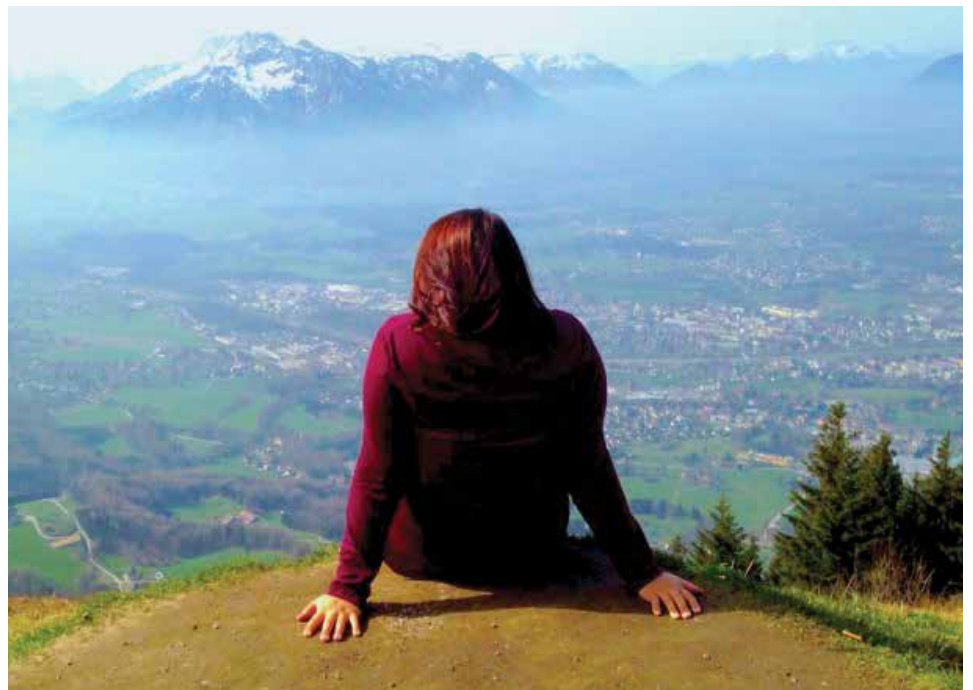
Gazing from the Gaisberg