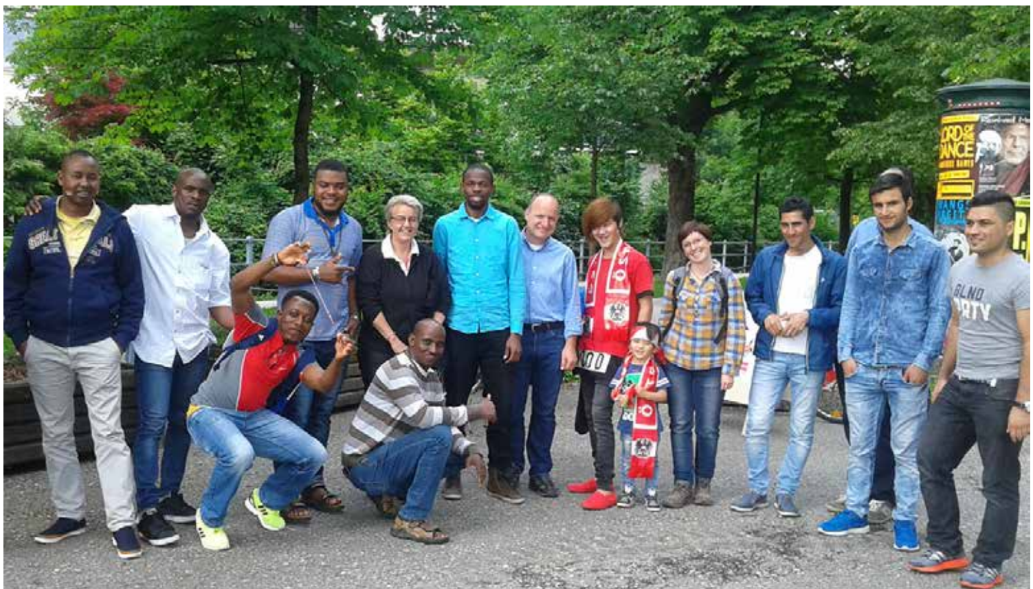
Refugees and Caritas volunteers

I was not doing the most important work, but I hope that what I did do helped.