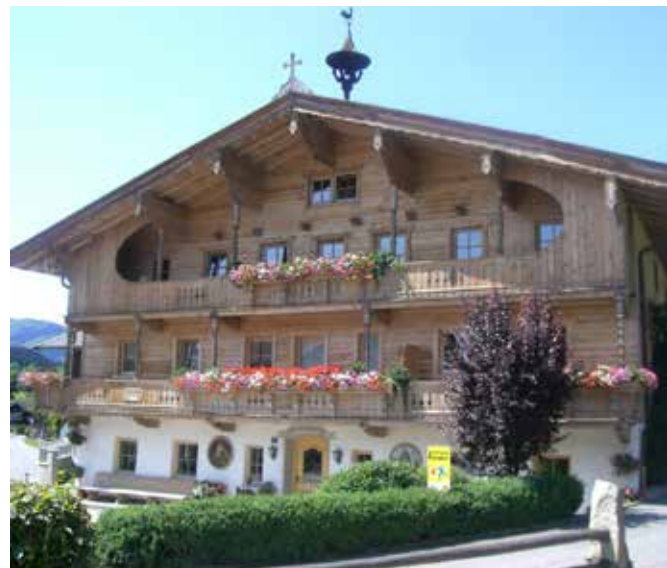
The farmhouse of the Bergbauernhof

in the other aspects of farm life such as horse grooming and cattle pasture preparation. Overall I could not imagine a better opportunity to experience a true Alpine way of life.