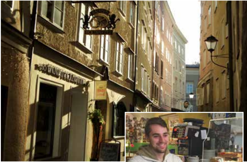
Bäckerei Holztrattner in the Brodgasse (built in 1350)