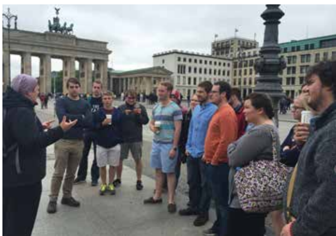
Listening to the guide at Brandenburg Gate

One of the highlights of spring semester was once again our Berlin trip. We arrived in Berlin by train on the Friday before Pfingsten (May 13) after stopping in Würzburg for lunch at Restaurant Stachel (built in 1413) and a visit to the Residenz, a UNESCO cultural heritage site, after which the students explored Würzburg on their own before we met again at the Bahnhof to catch our train to Berlin. Highlights in Berlin included a city walking tour with a very thoughtful and well-informed guide, a tour of the Reichstag (with an opportunity to take "Selfies" in front of Angela Merkel's office), visits to the Jewish Museum, the Deutsches Historisches Museum (our guide focused on the Weimar Republic) and Sunday evening's visit to the Theater am Kurfürstendamm, where we saw a performance of "The Ghetto Swinger," the story of Coco Schumann, a German-Jewish jazz guitarist and 'Lebenskünstler' from Berlin who survived Nazi incarceration in Theresienstadt and Auschwitz.