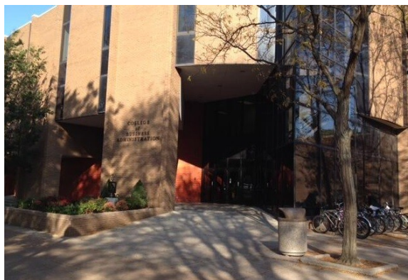
Conference Site: Business Administration Building.

With a steady turn out for each panel, conference attendees even had the option to follow along with a Twitter hashtag (#bgsucon13). This allowed attendees to engage with multiple concurrent panels and share their reactions to topics.