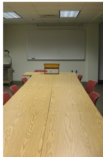
East Hall 206: The site of most defenses and lectures.

"Relationship Literacy and Polyamory: A Queer Approach"