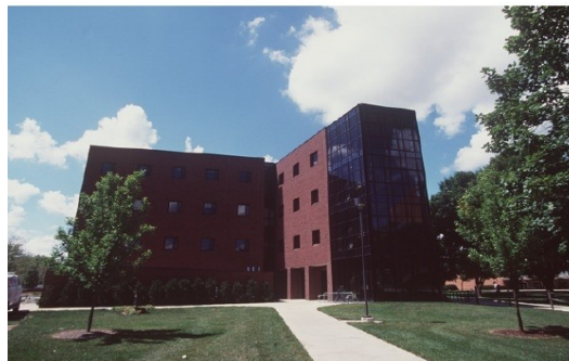
East Hall: English Department Home