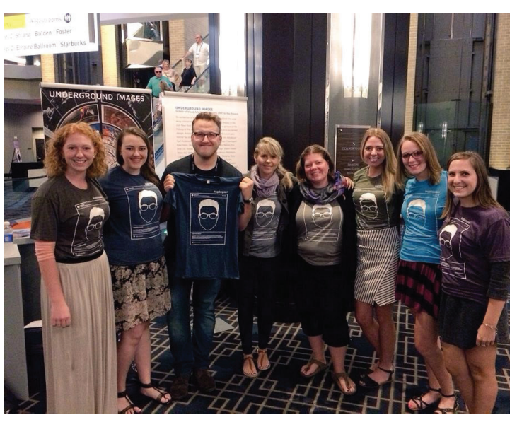
Graphic design students attended the October 2015 AIGA National Conference in New Orleans.