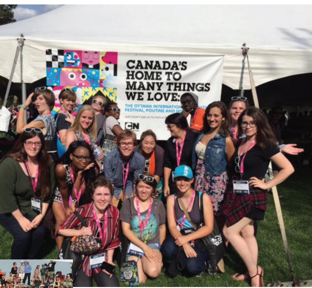
Computer Art Club members were immersed in animation at the Ottawa International Animation Festival.