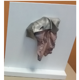
Claustrophobia earns award