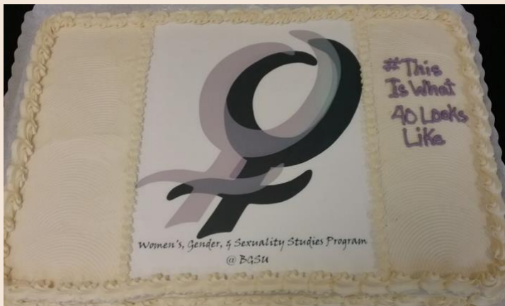
Every birthday needs a birthday cake! Happy birthday WGSS!