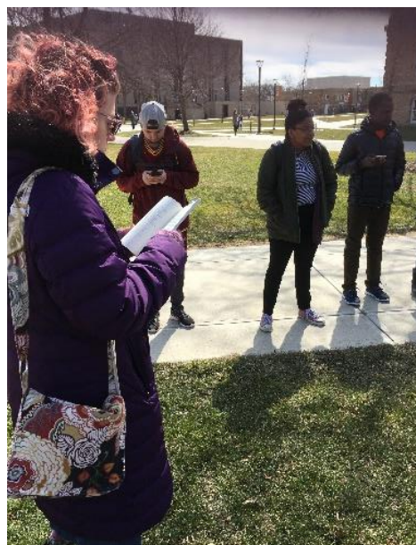
Below: 20 th annual "Bring Your Favorite Female Coach/Professor/Mentor to event"