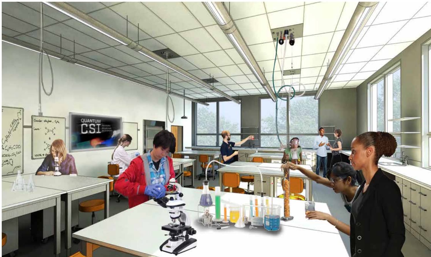
Moseley Hall is undergoing a significant renovation for a new science complex.