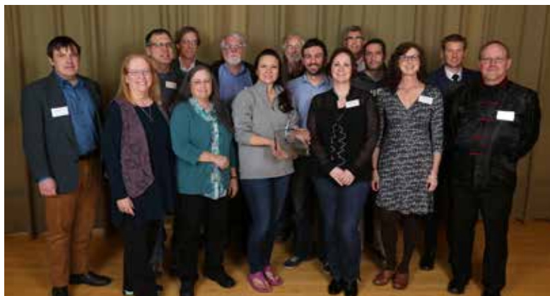
Faculty Senate recognized the Department of Biological Sciences for excellence in education.

Read more at www.bgsu.edu/news/2016/04/department-of-biological-sciences-receives-unit-recognition-award.html