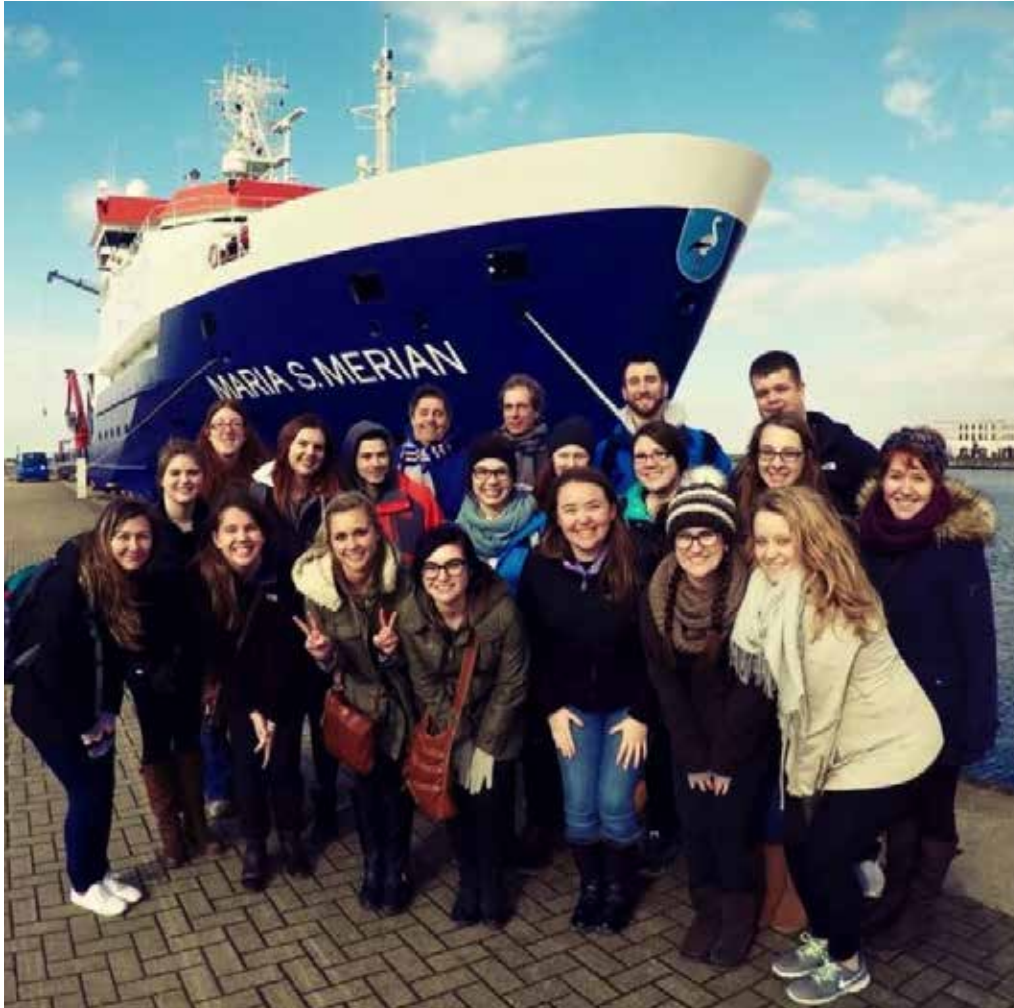
Students pose by the Institut für Ostseeforschung Warnemünde research vessel Maria S. Merian during their visit.