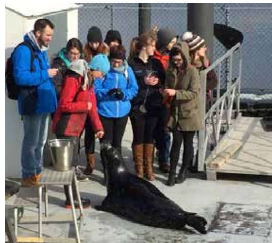
At the Marine Science Centre of Universitat Rostock, students interacted with one of the seals used in sensory research.