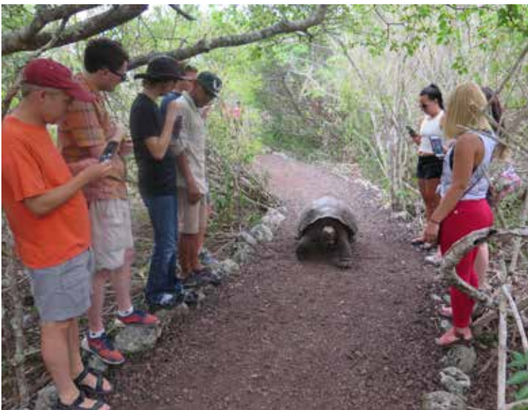
Students make way for tortoise to pass

Read more at www.bgsu.edu/news/2018/09/in-the-footsteps-of-darwin.html