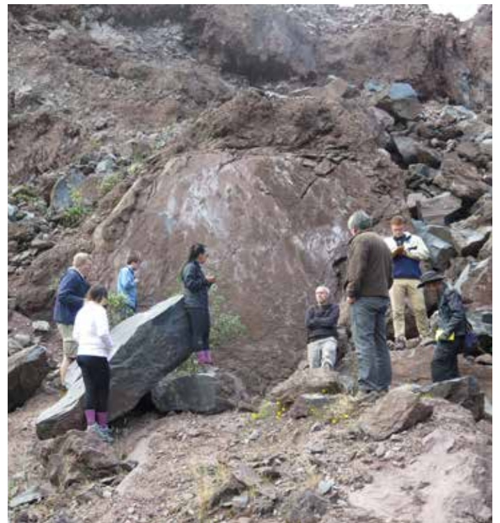
Geological wonder provides backdrop for lesson