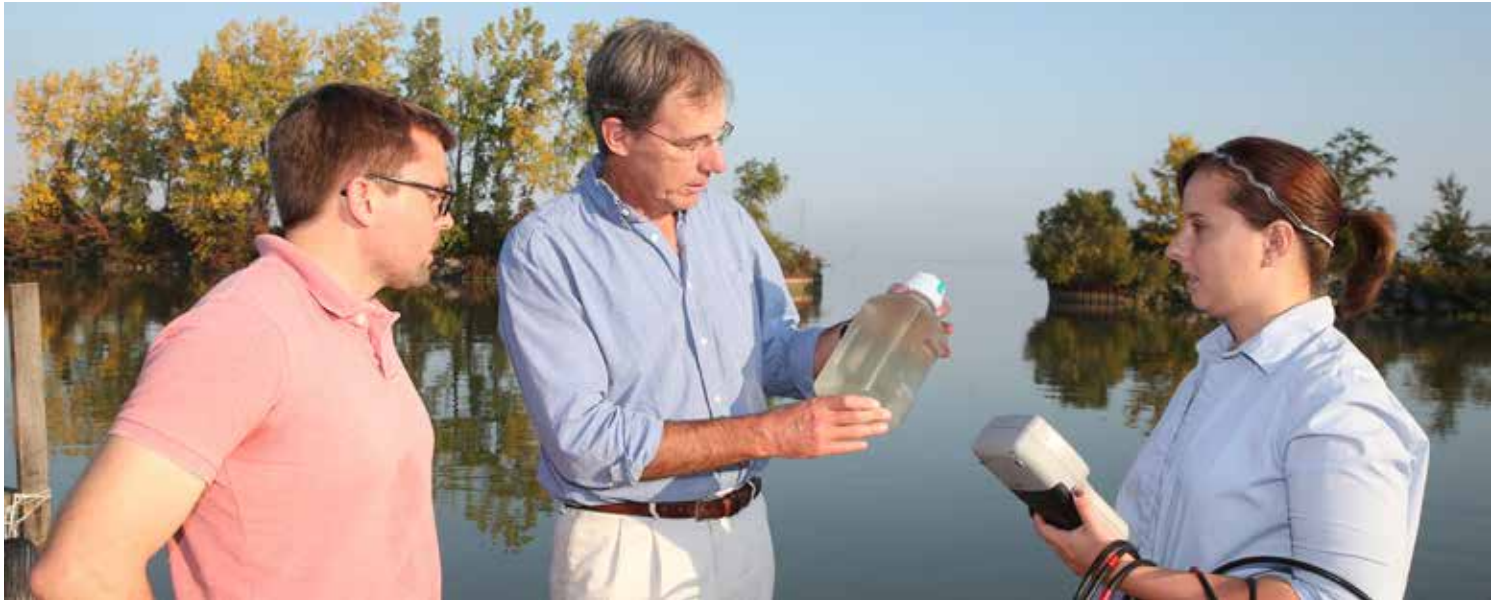
BGSU researchers look at Lake Erie water quality

In 2018, Ohio's Environmental Protection Agency and Gov. John Kasich designated the western basin of Lake Erie – from Toledo to Marblehead – as an impaired waterway due to toxic algae. This designation comes after consultation with experts from Bowling Green State University, among other organizations.