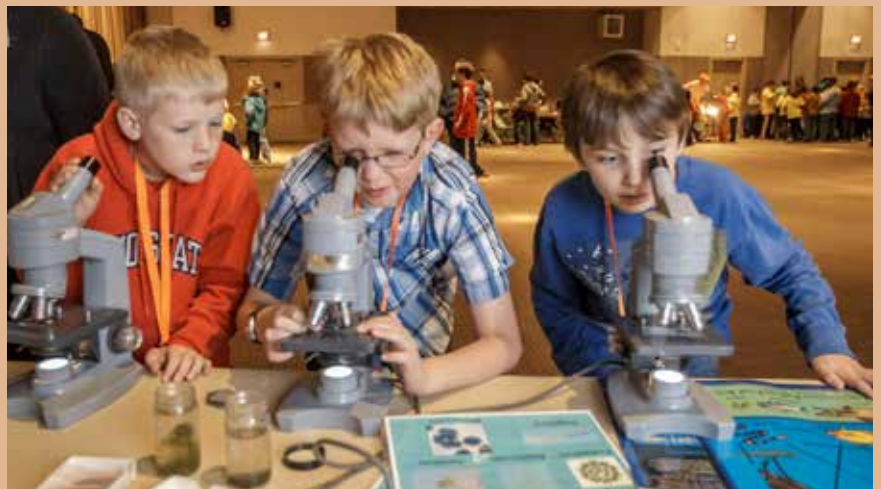
Kids Tech participants eyeball algae under a microscope