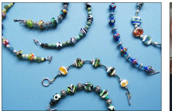
• Examples of Tom Klein's artistry.