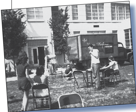
• Rehearsal on the school lawn in 1949.