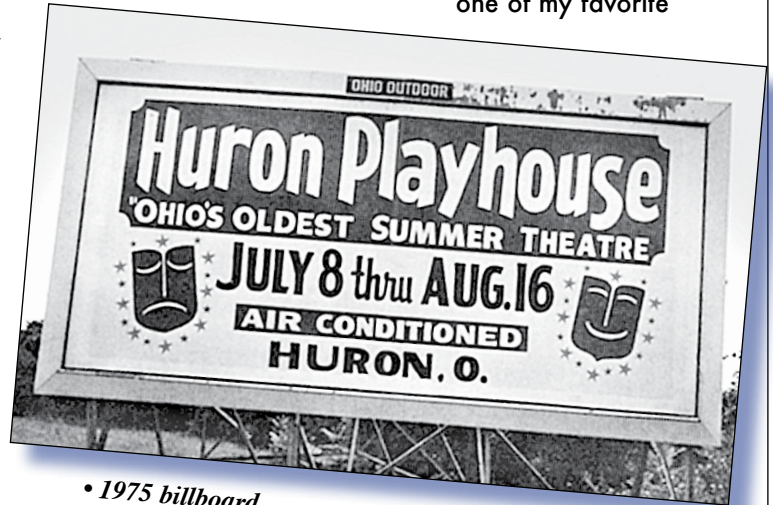
• 1975 billboard

to reduce expenses, including producing fewer plays and reducing the 40-45 student company and other support staff. Major sponsors for individual plays are also being studied.