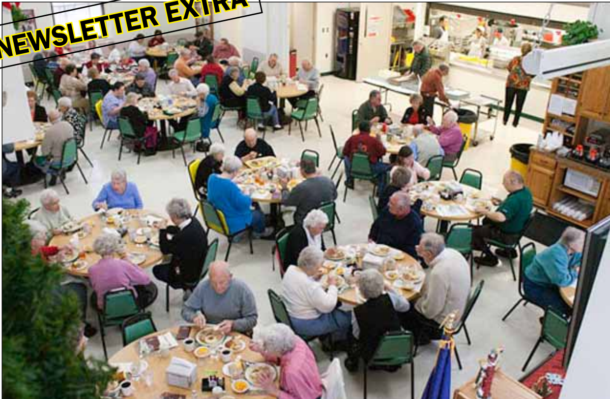
• The work area in the old Bowling Green Post Office building now is the dining area for the Wood County Senior Center.