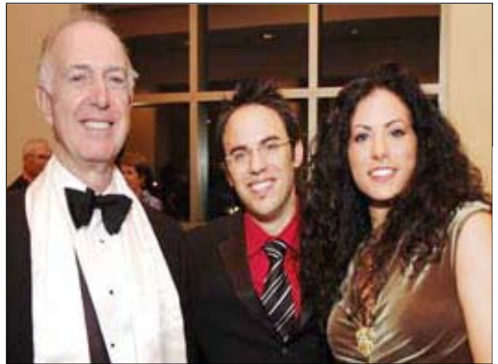
VIRGINIA OPERA ASSN.