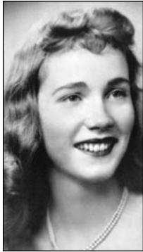
• Eva Marie Saint in 1945.