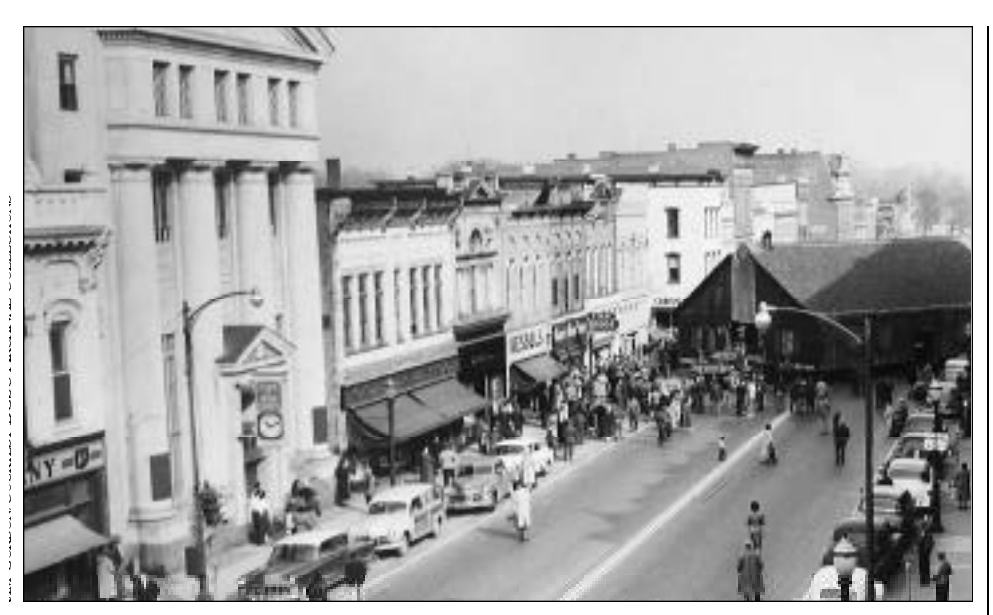
• Main Street 1955 as the original log-cabin-like Falcon's News was towed from campus to Portage, where the building serves the community there as the American Legion Hall.