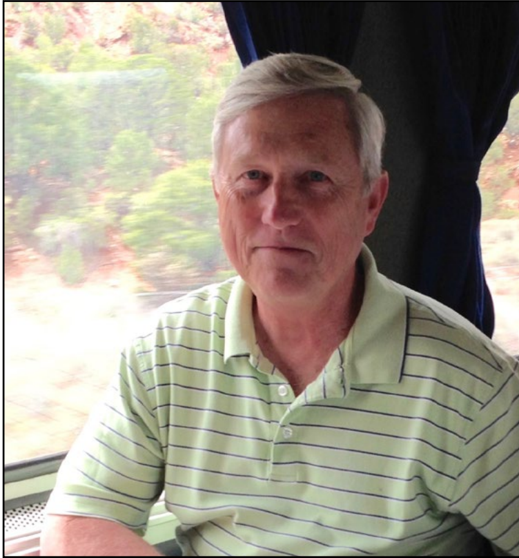
Enjoying lunch aboard Amtrak's Southwest Chief