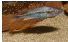
Figure 1: Haplochromis Piceatus .

Microsatellites are able to incorporate large ecological issues into small scale, genetic approaches by focusing on nucleotide repeats in a genome. Through polymerase chain reaction (PCR), specific primers can identify flanking regions and amplify microsatellite loci of interest (Selkoe & Toonen, 2006). Through the use of fluorescently labeled primers, we were able to go beyond differentiating the crude estimate of allelic length and determine the length of each allele. The overall goal of the project is to 1) Determine the overall genetic diversity of the Haplochromis-Piceatus population in the Toledo zoo and, 2) determine if (and how much) genetic diversity is decreasing within the population.