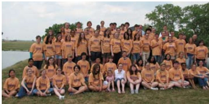
2007 String Orchestra Camp

All classes and orchestras will be conducted by string specialists. Daily activities include chamber music and string ensembles. Complementing the learning experience are lectures and demonstrations, master classes, technique classes and private lessons. The camp culminates with performances by the student participants in a finale camp concert.