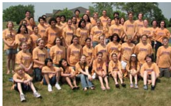
2007 Piano Camp