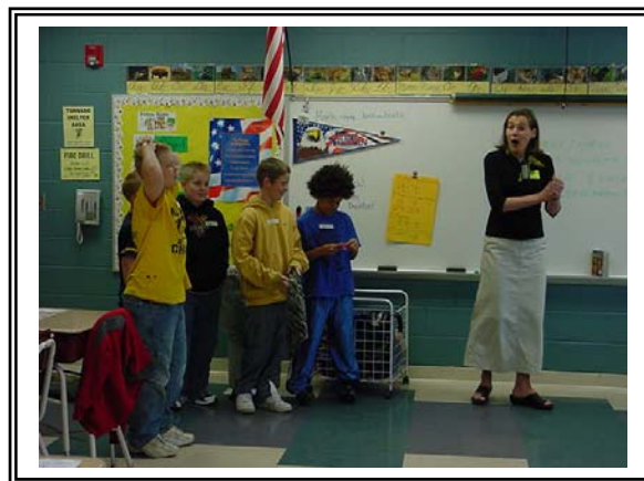
Fairfield Elementary, Maumee City Schools