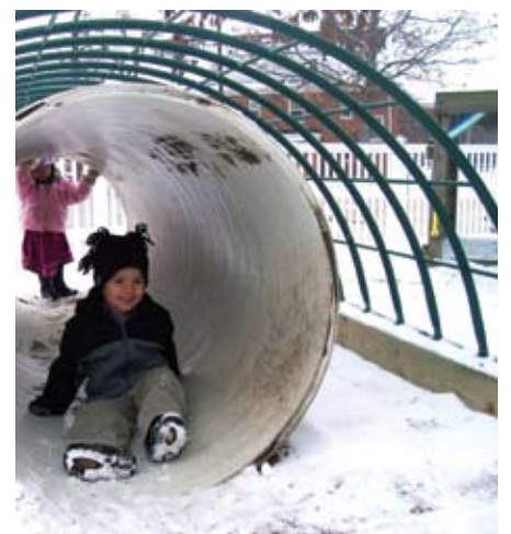
Children enjoy some of the new playground equipment at BGSU's CDC.

Your contributions make a huge difference. Each and every dollar helps us maintain and enhance the reputation we have earned for high-quality programs and top-notch graduates. Thank you so much for your help!