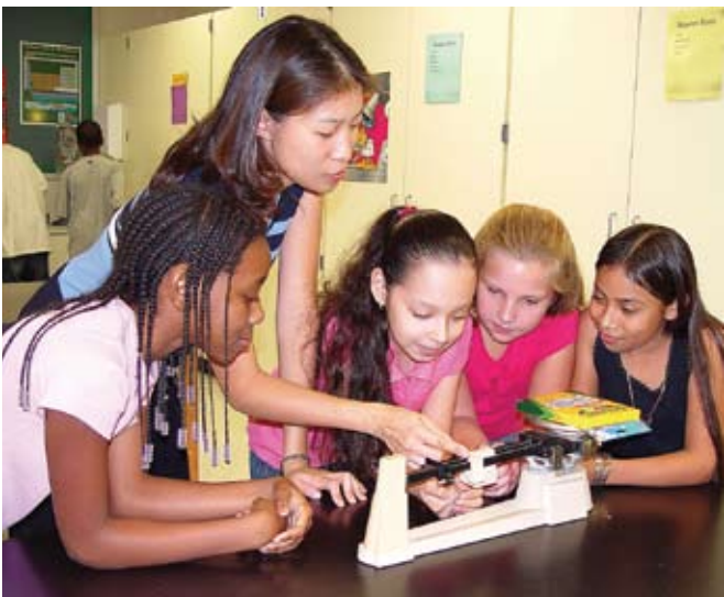
Aldine students learn about weights from one of their teachers.