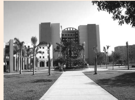
Florida International University's campus has a different look than BGSU.