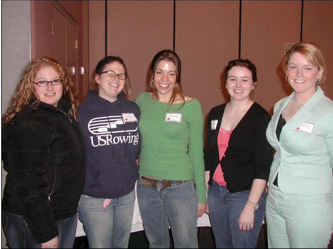
Several students attended the Ohio Canadian Studies Roundtable to help get prepared for their upcoming internships with the Canadian Parliament.