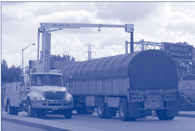
Inspecting cargo via gamma ray imaging at the Detroit-Windsor gateway, the nation's and the world's busiest border.

In November, President Bush made his first official visit to Canada, the first by a sitting American president in ten years. This coincides with the tenth anniversary of the North American Free Trade Agreement (NAFTA) which created one of the world's largest trading blocs. Building on NAFTA, itself an expansion of the 1989 Canada-U.S. Free Trade Agreement, negotiators are discussing a Free Trade of the Americas Agreement (FTAA). Despite these trilateral and multilateral developments, the Canada-U.S. relationship remains central to the well-being of North America. The bonds created by the largest flow of merchandise and people, a shared geography, and extensive family connections should never be taken for granted.