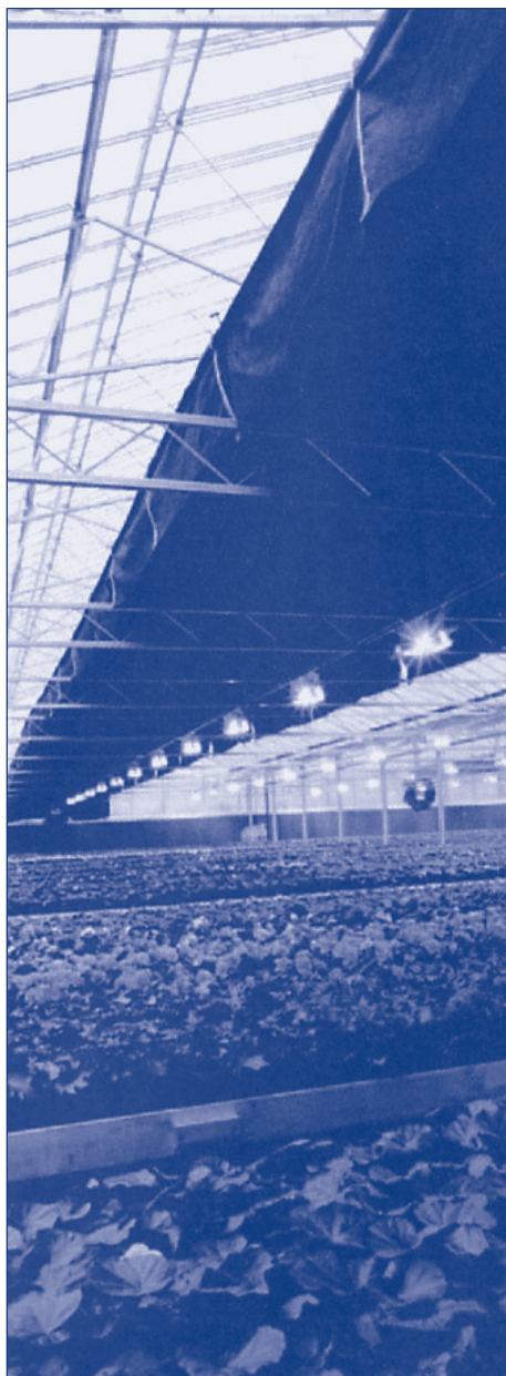
High-tech horticulture in Ontario.

The Canada-Ohio Business Dinner Workshop is possible due to generous support by the Alcan Aluminum Corporation, the BGSU Center for Policy Analysis and Public Service, and assistance from the Government of Canada.