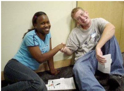
Picture of partners at the CCCC Party