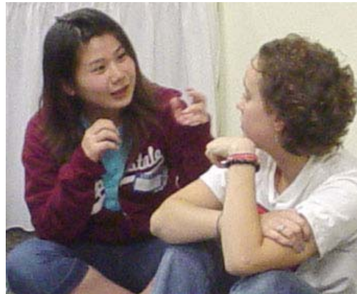
Picture of partners at the CCCC Party