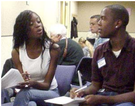
Picture of partners at the CCCC Party

The purpose of the CCCC Program is to develop cultural understanding in today's global community by connecting people from different cultures through conversation.