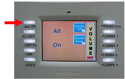
Diagram A- All On