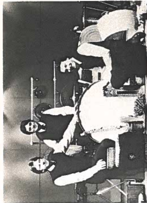
The Percussion Group/Cincinnati

The Percussion Group/Cincinnati enjoys a distinguished reputation as one of the foremost ensembles working in contemporary chamber music today. Throughout North America and Europe, the group's concert tours, residencies, workshops, and recordings have brought critical commentary proclaiming the rarity of percussion music being performed with the discipline, skill, finesse, and excitement which this group brings to its presentations. Formed in 1979 as a continuation of The Blackearth Percussion Group (1972-79), members of the trio are faculty and ensemble-in-residence at the College Conservatory of Music, University of Cincinnati, where the group's daily rehearsal schedule is supplemented with the teaching and coaching of young musicians. A significant body of new percussion music owes its existence to the stimulus provided by the group, the eleven works recorded on disc representing only a small portion of the compositions written for, dedicated to, or first performed by The Percussion Group/Cincinnati.