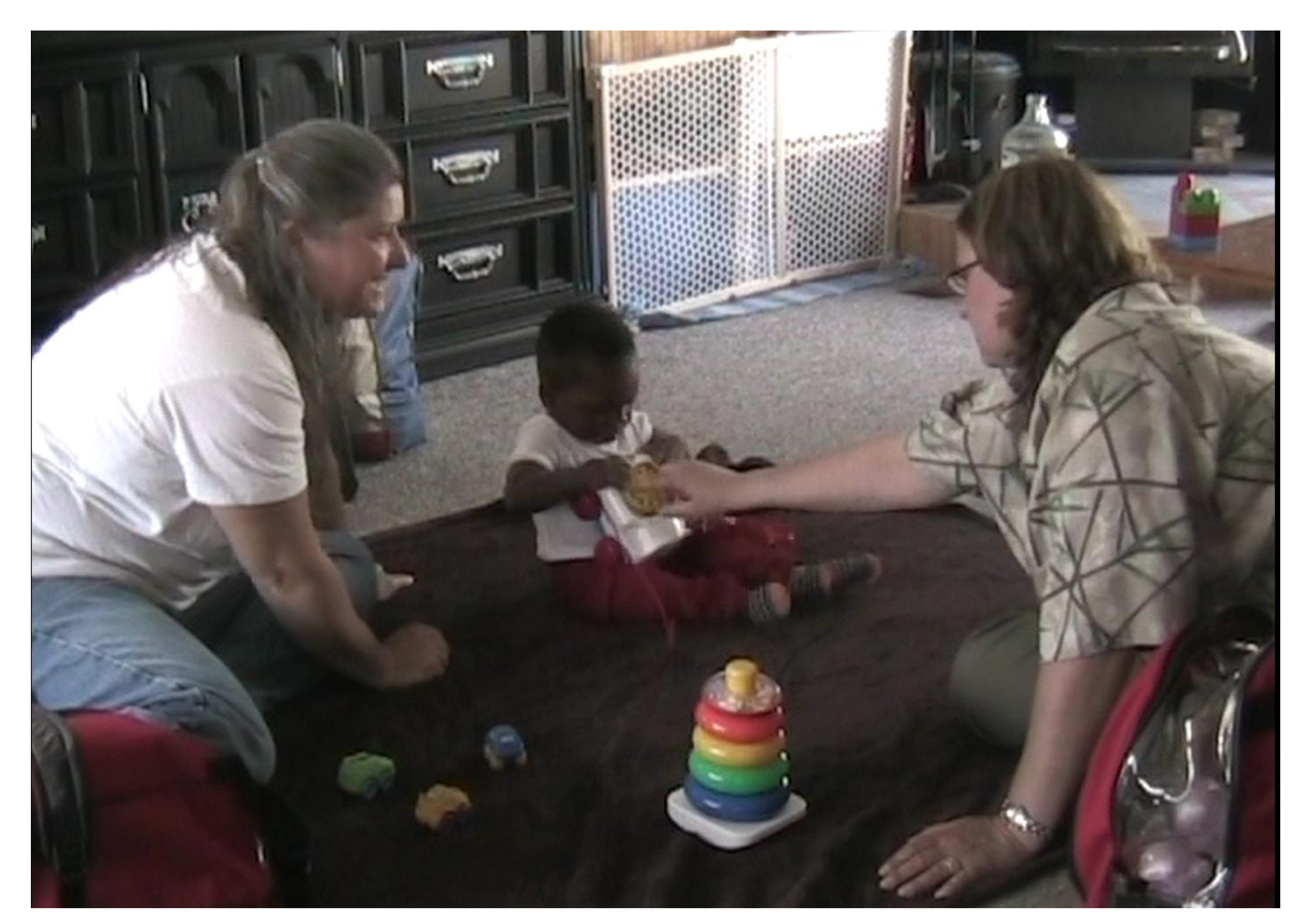
N = 104 adoptive families with young children (ages 1-5 years)