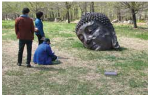
GRAD ARTS MEMBERS NEXT TO ZHAN HUAN'S LONG ISLAND BUDDHA