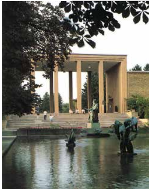
CRANBROOK ART MUSEUM