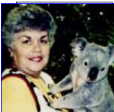
• With koala in Australia, 1997.

Wally Pretzer, activities chief for the BGSURA, said it's a "fun activity for dancing, watching, eating, drinking and chatting. Pretzer may be reached at dpretze.bgsu.edu or 352-8057. □