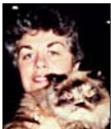
• With the late Tiffany, a Seal Tortie Point Himalayan.