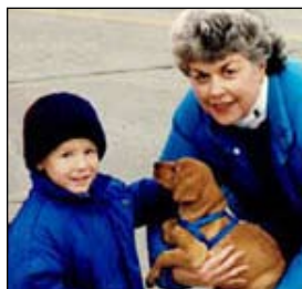
• Making friends marching in BG's Holiday Parade.