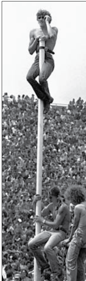
BGSU PHOTO SERVICE