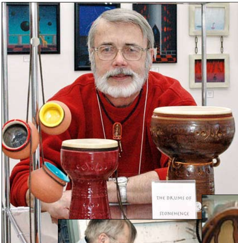
• Top: With pottery on display at Arts in Common Gallery, South Main Street.