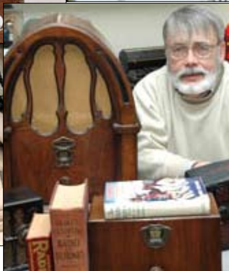
• Top: Checking dealer stock at a stamp show in Findlay. Left: In his den with antique radios.