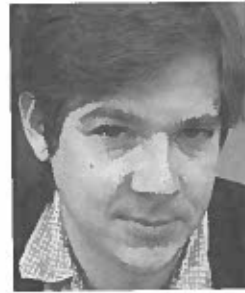
VAIN RATIONS AVIAN RIOTS