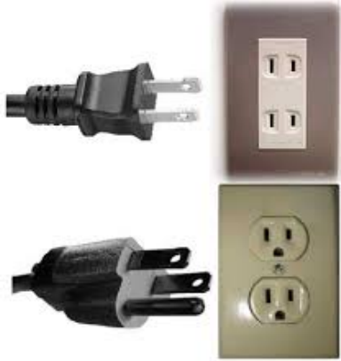
Picture of US Electrical Outlet 1

• Travel adaptor. Find ones that work with your devices (or one adaptor for multiple devices, if possible). Lighting and general purpose receptacles are at 120 volts AC.