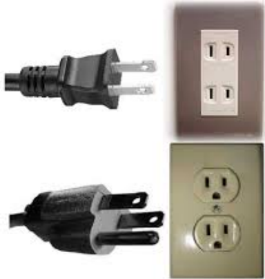
Picture of US Electrical Outlet 1

• Travel adaptor. Find ones that work with your devices (or one adaptor for multiple devices, if possible). Lighting and general purpose receptacles are at 120 volts AC.