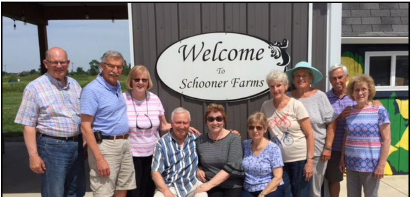
A photo of the group that toured Schooner Farms in June.