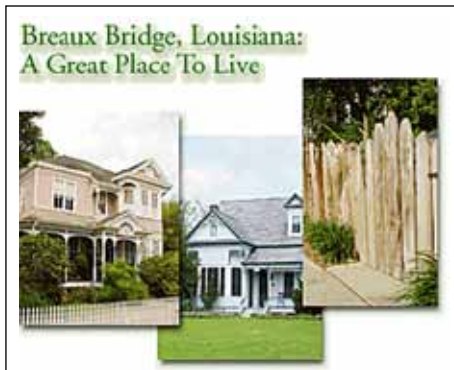
BREAUX BRIDGE CHAMBER OF COMMERCE

I HAVE been studying French with more or less intensity most of my adult life. My present approach to the language usually consumes from one to two hours a day. You might ask why the interest. I grew up not only in a bilingual home but also in Breaux Bridge, a bilingual community where one easily slipped from French into English. Breaux Bridge is a small town in Louisiana's Cajun country. As a child I spent many a Sunday afternoon listening to my aunts and uncles, who held a family reunion then, converse with no transition from French into English or vice versa. Surely under these circumstances I would have developed fluency in French. But that is not the case and I will tell you why.