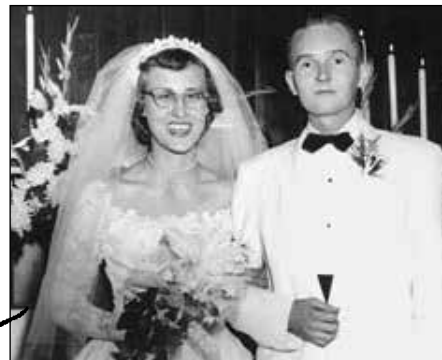
• Painesville, Ohio, Aug. 17, 1957