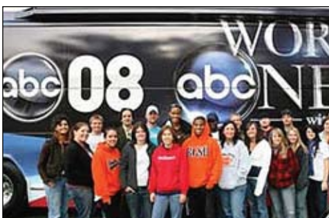
• BGSU students pose Oct. 7, 2008, during the Bowling Green visit of ABC-TV's Great American Battleground Bus.